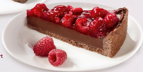
čokoládový dort s malinami