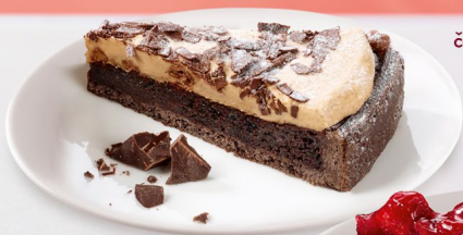
čokoládový dort se slaným karamellem