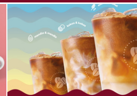
Krémové veganské ice latte