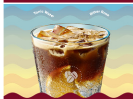
Osvěžující Espresso tonic