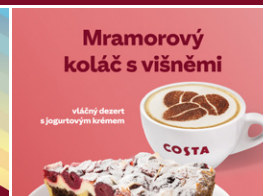
Mramorový koláč s višněmi